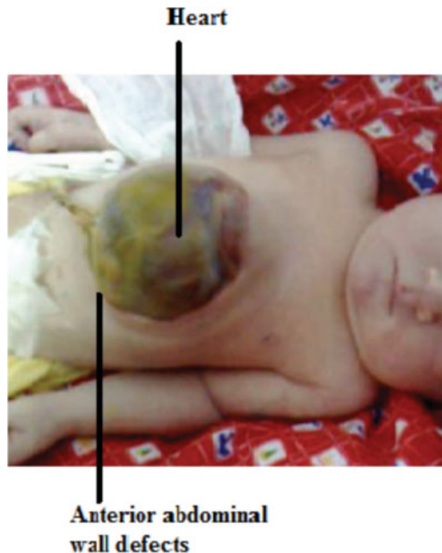
Fig. 2 Anterior view of the infant with PC. PC, Pentalogy of Cantrell.

tion and mechanical ventilation. The baby died after 24 hours because of cardiopulmonary arrest, and unfortunately, the parents did not give autopsy consent (► Fig. 2).