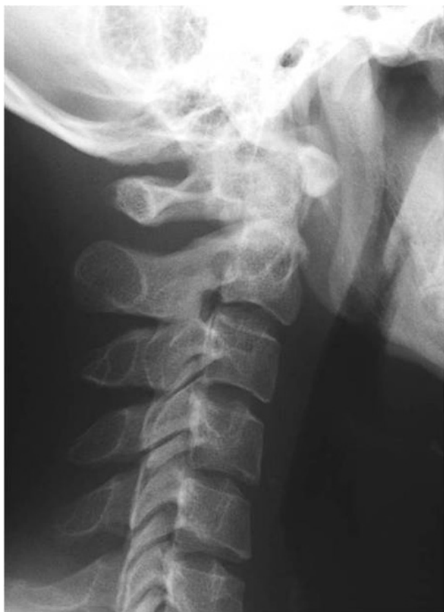
Figure 1. Retropharyngeal thickening and soft tissue calcification in front of the anterior arch of C1.