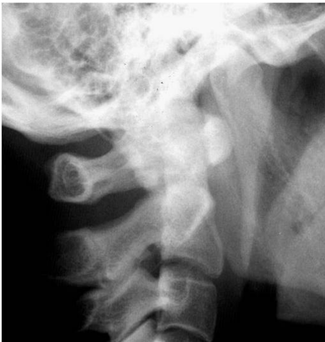
Figure 5. Swelling of the retropharyngeal space.

Patient C is a 24-year-old otherwise healthy Japanese male who presented with a 6 day history neck pain. The pain increased in severity until his presentation to the outpatient clinic. On examination there was a severely limited range of motion of the neck due to posterior neck pain. No neurological finding was detected. X-ray and CT scan showed swelling of the retropharyngeal space and calcification anterior to the dens (Figures 7,8). After