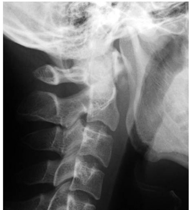
Figure 7. Swelling of the retropharyngeal space and calcification anterior to the dens.