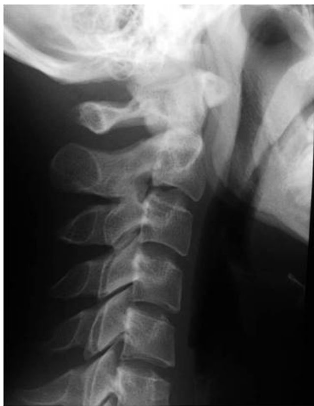
Figure 3. No swelling of retropharyngeal space.

Patient B is a previously healthy 35-year-old Japanese male who awoke three days prior to presentation with severe posterior neck pain. On examination, neck movement was restricted due to severe pain. There was no neurological deficit. WBC and CRP were mildly raised. Lateral plain film of the cervical spine revealed swelling of the retropharyngeal space (Figure 5). CT scan of the C-spine showed the calcification anterior to the dens (Figure 6). Symptoms resolved quickly with the administration of oral NSAID.