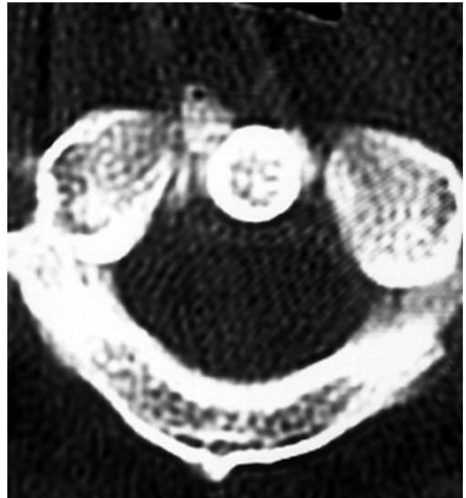
Figure 6. The calcification anterior to the dens.