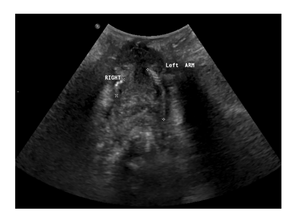
Figure 2. Right and left arms of a TVT mesh identified with ultrasound. TVT, tension-free vaginal tape.