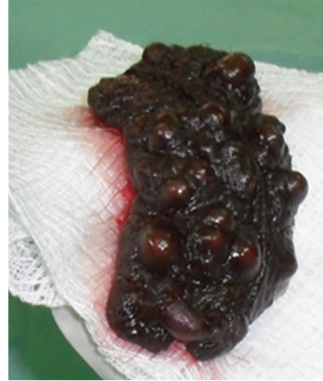
FIGURE 4: Postexcision scrotal calcinosis specimen.