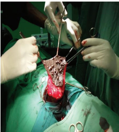
FIGURE 3: Excision of scrotal calcinosis.

Although Hicheri et al. reported rapidly evolving variant which occurred within 3 months [5]; the disease usually takes an indolent course, developing over several years as shown by the index case. Most patients are asymptomatic and present because of cosmetic concern. Few patients may present with pruritus, ulcerations, and discharge of chalky material with occasional superimposed secondary bacterial infection. Clinical diagnostic confusion may arise from other scrotal lesions such as calcified onchocercoma [6], solitary neurofibromas, ancient schwannomas, steatomas, lipoma, and fibroma. Biopsy for histological examination is necessary to differentiate scrotal calcinosis from such lesions. In scrotal calcinosis amorphous basophilic calcium deposits surrounded by monocyte or histiocytic inflammation can be seen on histological examination.