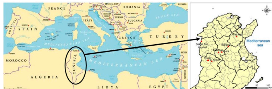
Figure 1. The geographical localization of the eight M. tunetana and M. sativa accessions [legend: Bargou: MT1; Makthar: MT2; Kesra: MT3; Sekiet Sidi Youssef: MT4; Thala: MT5–MT6; El Ayoun: MT7; Mograne: MS1].

analysis concerning edaphic parameters showed a significant difference at p < 0.05 . In fact, two types of soil are registered: a heavy soil for MT2 and MT7 in Makthar and El Ayoun with an average of 37.2 and 37.88% of clay content respectively and a sandy soil for all other prospected sites. The values of soil pH in this study ranged from 7.2 to 8.36 indicating an alkaline nature of soil for all M. tunetana sites (Table 1). On the other hand, the total limestone and active limestone content demonstrated that all sites are a calcareous soil especially for the MT2 soil from Makthar with a rate of 30.7% of active limestone in the soil. The analysis of potassium (K) content in soil was measured and the statistical analysis showed a significant K content differences which is ranging between 38 ppm for MT1 from Bargou to 297 ppm for MT3 from Kesra.