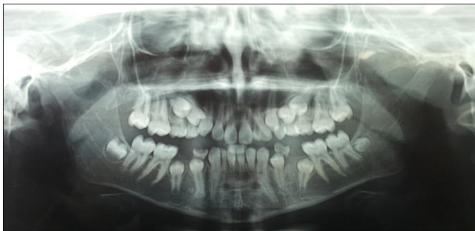
Fig. 1. Panoramic view of the patient

The prevalence of missing teeth excluding third molars varies in different areas with approximately 10.9% prevalence rate in the Iranian population [3]. Tooth germ may fail to develop or differentiate into dental tissues due to different factors. Genetics, radiation, trauma, inflammation and systemic disorders are considered the most common etiologic factors. Dental anomalies cause complications in mastication, speech and aesthetics, which may arise depending on the number of missing teeth [3]. Dens evagination (talon cusp in the anterior region) is an uncommon odontogenic anomaly comprising of a projection on tooth surface [4], which may cause malocclusion and aesthetic problems [5]. Although dens evagination may be found on the occlusal surface of posterior teeth, this anomaly is more commonly seen on the lingual surface of the maxillary lateral incisors (67%) followed by central incisors (24%) and canines (9%) [6]. The overall frequency of dens evagination has been reported to be 1-4% [1] and males are more affected than females [5]. Pulp stones are known as discrete intra-pulpal calcifications frequently found in molars [6-8]. Pulp calcifications vary in size ranging from tiny particles to huge masses that almost obliterate the pulp space [8]. Pulp stones have a clinical significance when root canal therapy is required.