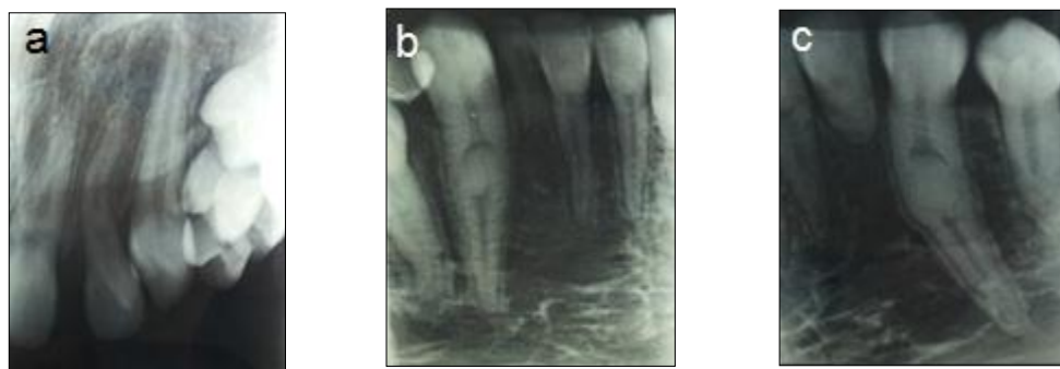
Fig. 2. Periapical radiographs (a: upper left region; b: lower right region; c: lower left region)

For further evaluation, selected periapical radiographs were requested and multiple pulp stones were detected in teeth #31, 41, 33, 43 and 22 (Fig. 2). Since the pulp stones were closely similar to dens invaginations, a cone beam computed tomography (CBCT) scan was ordered to confirm the diagnosis. Additionally, inspection by an explorer did not reveal any pit on the lingual surface of the anterior teeth that could have been mistaken for dens in dent. Based on the CBCT scan, pulp stones were located in the coronal part of the mandibular central and lateral incisors and in the root portion of mandibular canines and maxillary incisors and canines. (Figs. 3 and 4).