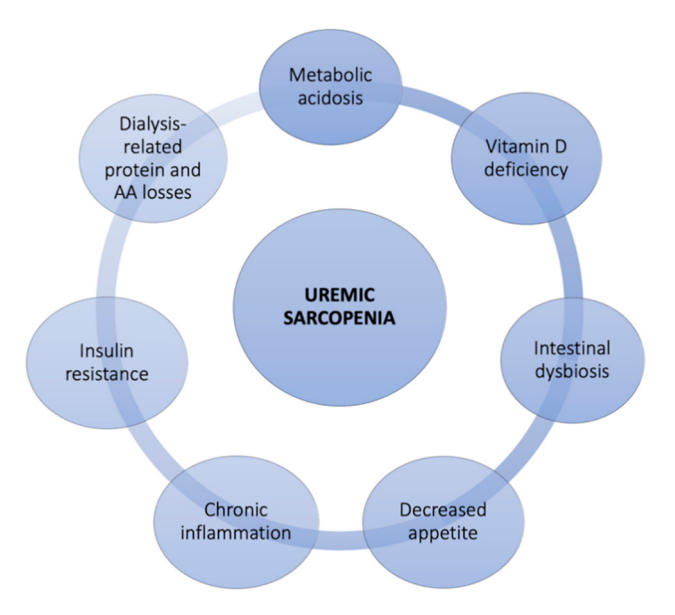
Figure 1. Possible causes of uremic sarcopenia. AA, amino acids.

Loss of MM is common in CKD, especially in ESRD patients in hemodialytic treatment [2–4,31]. In this population, the consequences of MM loss are not only related to reduced physical ability, as happens in the elderly population. Many studies in fact have associated the loss of MM in CKD to the reduction of Qol, to the manifestation of PEW, to fractures, to CV complications, to loss of graft and to postoperative complications in kidney transplant [35,36]. These conditions together lead to an increased risk of hospitalization and mortality in the nephropathic patient with sarcopenia [25,37,38]. For this reason, sarcopenia can be considered a negative prognostic factor in CKD patients and only an adequate knowledge of this pathology and the mechanisms involved in its genesis can allow a valid and effective treatment of the same [39]. The possible etiological factors involved in MM loss in CKD patients are various, as reported in Figure 1.