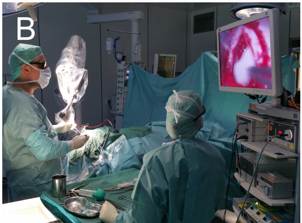
FIGURE 1: Operating room set-up and exoscope during surgery

Operating room set-up (A) with * = VITOM 3D exoscope attached to holding arm (Karl Storz GmbH, Tuttlingen, Germany), ** = IMAGE 1 PILOT, *** = 3D monitor, and **** = IMAGE 1 camera system and cold light fountain. Exoscope during surgery (B), depicting the surgeon's ergonomic posture.