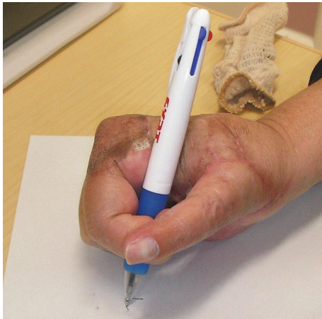
FIGURE 4: Postoperative appearance of the right hand. The patient used the pollicized thumb for activities of daily living, such as writing.