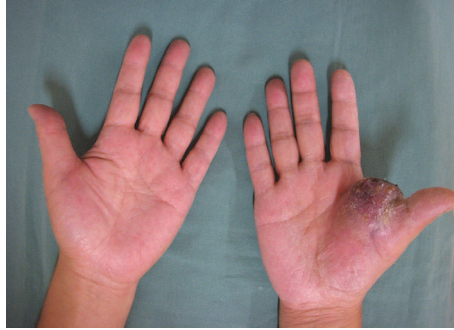
FIGURE 1: Soft tissue mass in the right hand. The mass was located in the first intercarpal space, with the overlying skin showing discoloration.

to low intensity on T1 weighted images and heterogeneously high intensity on T2 weighted images. After intravenous administration of gadolinium-based contrast agent, the mass was well enhanced peripherally, but the central region was poorly enhanced, suggesting necrosis. The mass was adjacent to the first metacarpal bone (Figure 2).