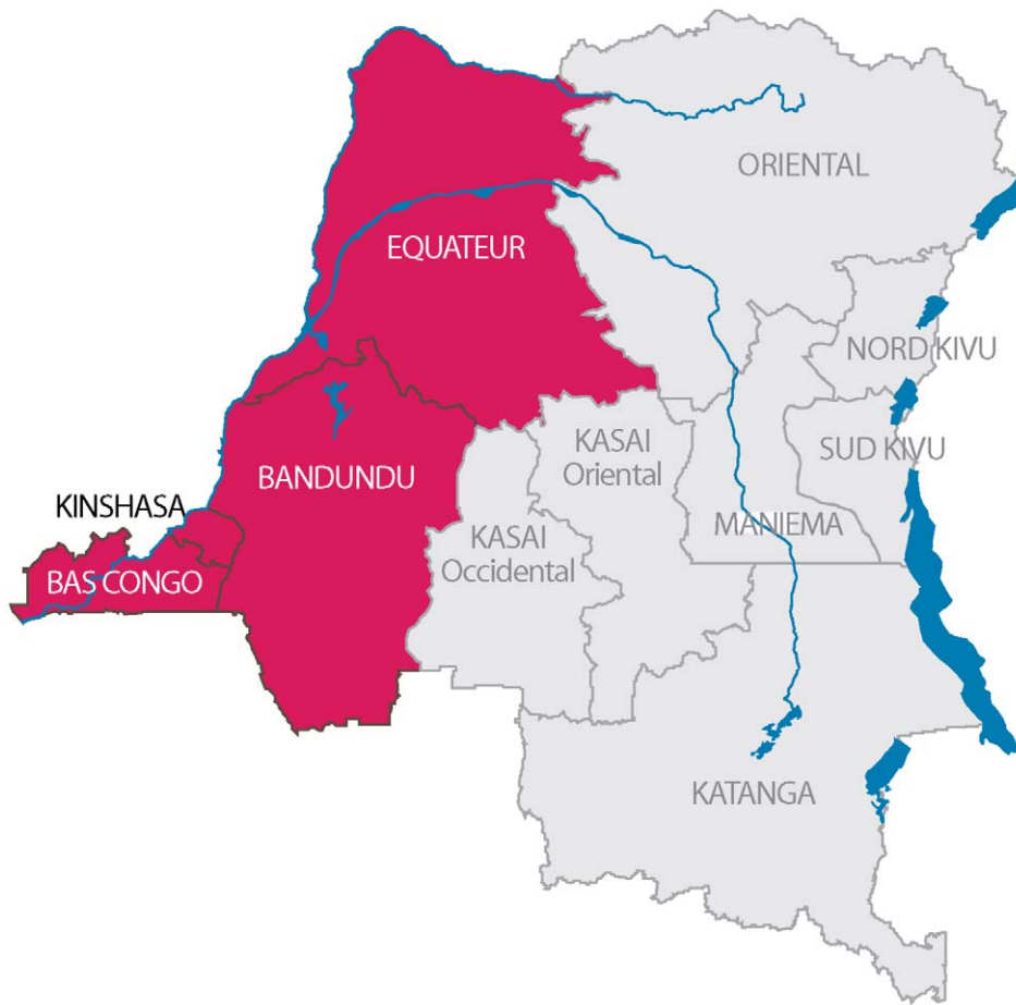
Figure 1. Origins of the pigs included in the market study. doi:10.1371/journal.pntd.0000817.g001

temperature, centrifuged, and serum was collected. Serum was stored at -20^{\circ}\text{C} until analysis and later tested with the ELISA for the detection of circulating antigen of the larval stage of T. solium (antigen ELISA, [20]), which enables the detection of active infections (presence of viable cysts).