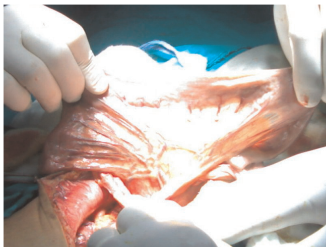
Figure 2. A photograph showing the whole length of small gut completely free from the already described pneumatosis cystoides intestinalis.

The author in this case report put the question whether pneumatosis cystoides intestinalis is the direct cause of perforated duodenal ulcer or the result of this disease process as advocated in other previous reports [10,11].