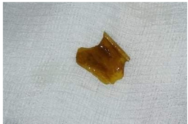
Fig. 2 – Extract sharp animal bone 25 × 19 mm.

a focal edematous mural thickening, hyperemia, mild adjacent fat stranding, and mild free fluid at the pelvis. On the other hand, there was no free intraperitoneal air and no proximal dilatation. Multiple diverticula were seen at the sigmoid colon with no sign of inflammation. Additionally, we found normal liver (size, density, and shape), no focal lesion seen in the portal and hepatic veins, normal intra and extrahepatic biliary tree, normal gallbladder, normal spleen, pancreas, adrenal glands, both kidneys size, shape, density and contrast excretion, no stone or hydronephrosis, no focal mass, normal urinary bladder, no pelvic mass, no bony lesion. Under sedation by colonoscopy the piece of meat bone with sharp edge removed size 25 × 19 mm (Fig. 2) in the ileocecal valve using polypectomy snare and alligator forceps (Fig. 3). There was ulceration in the ileum and ileocecal valve with stenosis; biopsies were taken. There were no immediate signs of perforation. The patient was admitted for 24 hours of observation and discharged without any complication after im-