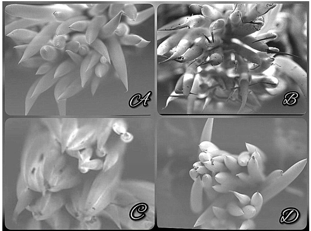
FIGURE 1: SEM micrographs of toothbrush bristles following 24-hour decontamination.

Images A, B, C, and D are micrographs of bristles placed in an air-vented container, distilled water, chlorhexidine, and HiOra mouthwash respectively.