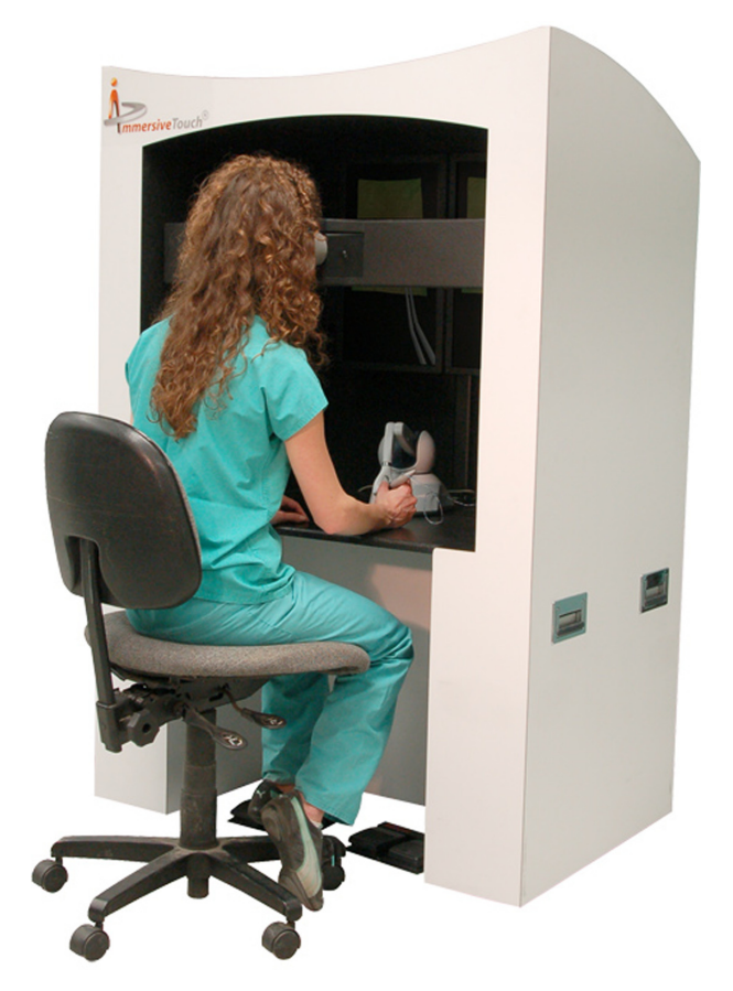
Figure I An image of an operator using virtual reality system MicroVisTouch (ImmersiveTouch, Chicago, IL, USA) using haptic (tactile) feedback and stereo viewer for vitreoretinal surgery simulation.

We then designed a computer-based simulator for epiretinal membrane (ERM) and internal limiting membrane (ILM) peeling procedures with the idea to develop a high performance haptics-, physics-, and graphics-enabled simulator. The study was conducted on the MicroVisTouch surgical simulator (Figure 1), which has the following specifications: Dell