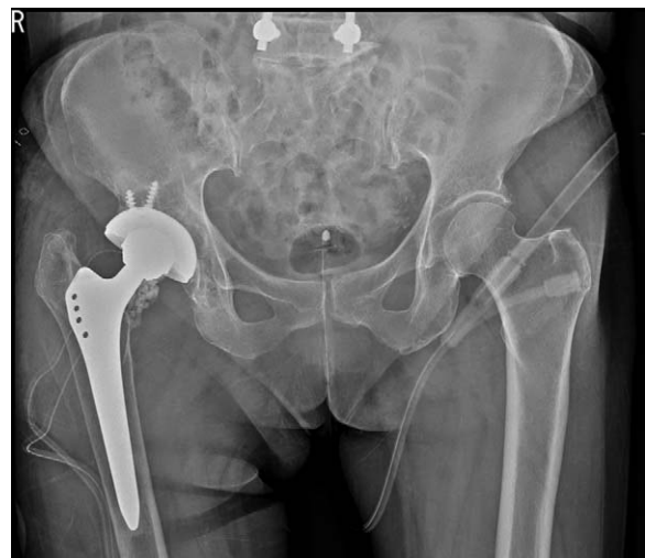
Figure 3. Since intraoperative frozen biopsy showed 10 neutrophils/high power field, antibiotic-loaded cement beads were inserted.