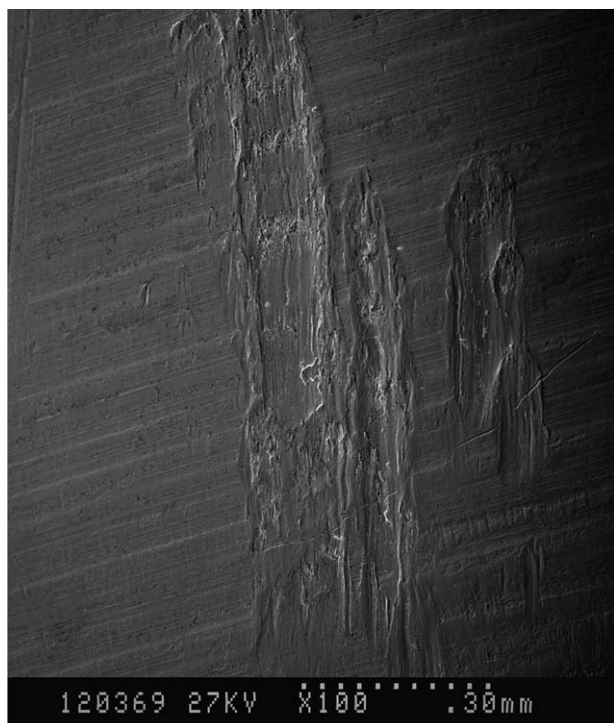
Figure 5. The female taper of the metal head showed signs of corrosive wear.

Compared to poly-on-metal articulation, metal-on-metal articulation is superior in linear wear rates. However, complications such as pseudotumors, which is thought to be an immunologic delayed hypersensitivity response to the metal particles, have been reported. Metal-on-metal hypersensitivity reactions are considered to be local hypersensitivity Type-IV reactions, also referred to as aseptic lymphocytic vasculitis-associated lesions (ALVAL). [4] This local tissue reaction, described as an ALVAL was characterized by Willert et al [9]