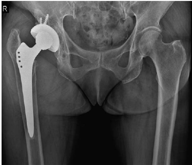
Figure 1. The patient underwent metal-on-metal bearing THA 11 years ago for treatment of right sided hip pain due to avascular necrosis.

febrile sensation, generalized weakness, and limping in her right leg for several months. There was no redness, heatness, and sinus tract. The patient underwent THA for treatment of right-sided hip pain due to avascular necrosis 11 years ago (Fig. 1). Instrument implanted was Zweymüller stem with metal-on-metal bearing surface (Alloclassic-SL; AlloPro AG, Baar, Switzerland). Despite of the operation, the patient suffered from consistent right hip pain of the visual analog scale (VAS) score 5. A huge cystic mass was detected in her right pelvic and hip area on abdominal computed tomography (CT) (Fig. 2). In laboratory findings, WBC count was 13,800 (normal range, 3600–9600) with the 82% neutrophil (normal range, 37%–72%), ESR 82 mm/hour (normal range, 0–20 mm/hour) and CRP 77.1 mg/L (normal range, <5 mg/L). Under the impression of the abscess, percutaneous catheter drainage was inserted into the iliacus cystic