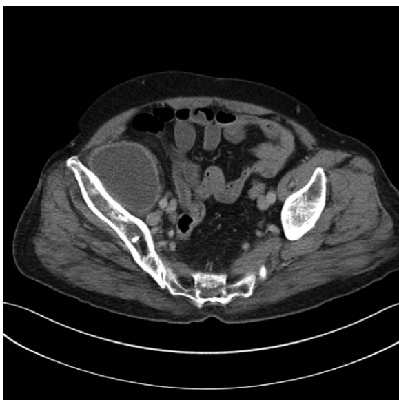
Figure 2. Pelvic CT scan revealed abscess-like cyst in the iliacus muscle.