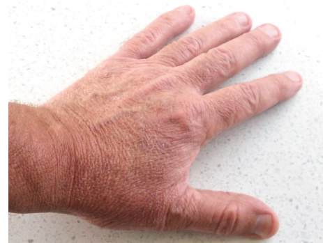
FIGURE 3: Hand at two years after treatment, showing normal skin and no signs of recurrence.

The use of honey to treat AK has not yet been documented; a MEDLINE/PubMed and google scholar search for “honey” AND “actinic keratosis” OR “solar keratosis” (October 2017) did not find any similar cases in the literature. Although spontaneous resolution of AK is seen in its natural history, the mean time for this is 17 months, with a 15% recurrence rate [7]. This suggests that the properties of Kanuka honey may aid and expedite clearance of AK.