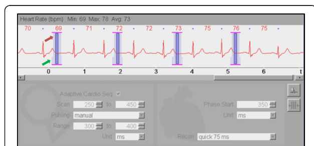
Figure 1 ECG strip demonstrating timing of image acquisition.

Volume CT dose index (CTDI vol ) and dose length product (DLP) for the CTA scans were recorded and effective dose was calculated [12].