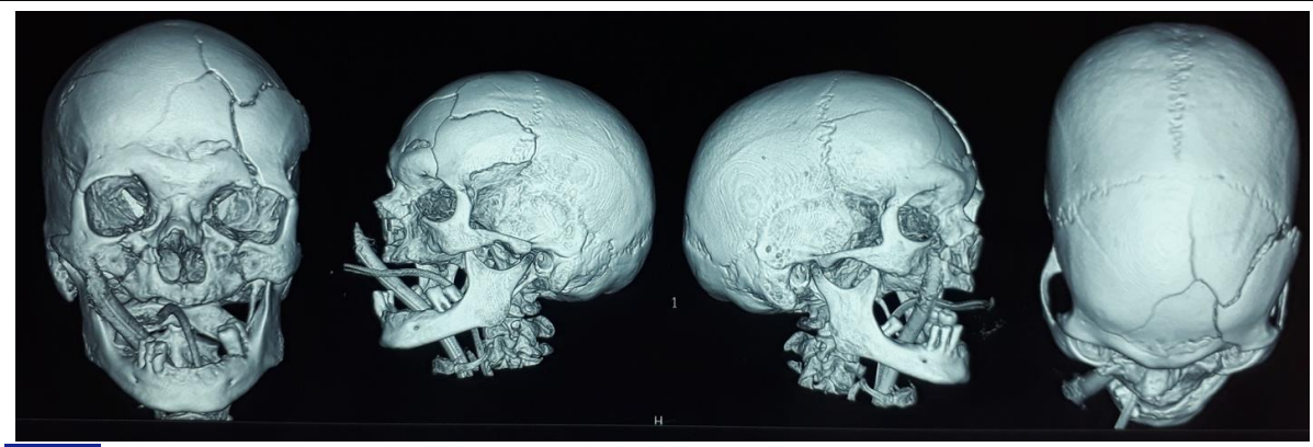
Figure 3: Patient's 3D reconstruction skull CT scan