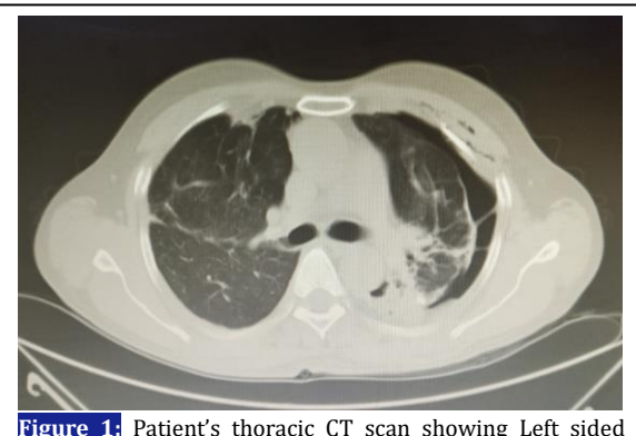
Figure 1: Patient's thoracic CT scan showing Left sided pneumothorax

The patient was managed conservatively with antibiotics and analgesics; his stay during the hospital was uneventful. He was discharged on sixth day and was advised to follow up if any new complaints developed.