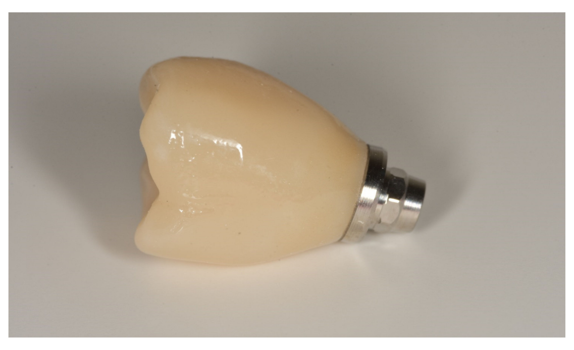
Figure 3. Lateral view of the monolithic CAD/CAM lithium disilicate crown luted to the screw-retained abutment.