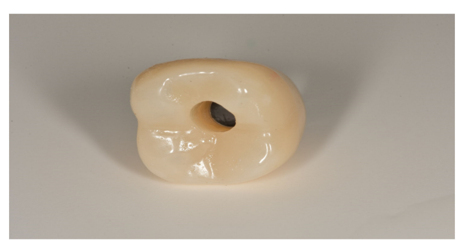
Figure 2. Occlusal view of the monolithic CAD/CAM lithium disilicate crown with the screw access hole.