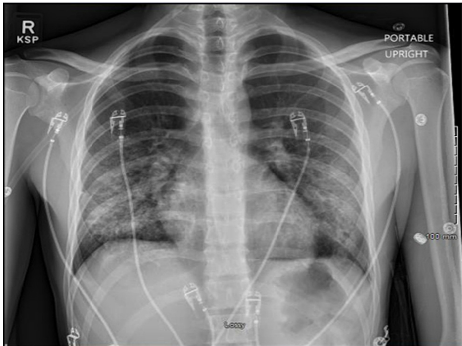
FIGURE 3: Chest X-ray after methylprednisolone treatment.

The patient was hospitalized for a total of seven days, and he was discharged on prednisone 60 mg tapered dose over two weeks and supplementary oxygen (3 L of O 2 with exertion). Five weeks after the hospital admission, the patient was evaluated at the pulmonary clinic for follow-up. He has been asymptomatic and AHRF has completely resolved.