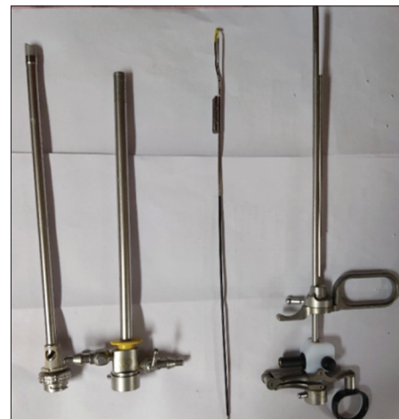
Figure 1: Conventional resectoscope with accessories

Input/output was strictly monitored. The procedure was stopped whenever fluid deficit reached 1000 ml. Serum electrolytes were checked preoperatively and postoperatively in all the patients. The various parameters including time required for cervical dilatation, operating time, intraoperative complications such as cervical injuries, bleeding, uterine perforation and fluid absorption, postoperative morbidity like postoperative pain and