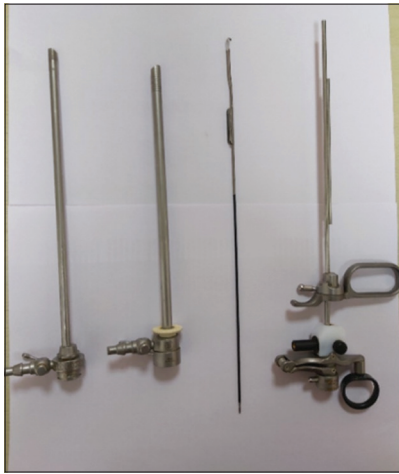
Figure 2: Mini-resectoscope with accessories

An earlier study by Colacurci et al. [16] had demonstrated that the operating time ( 23.4 \pm 5.7 ) using unipolar knife was significantly higher compared to 5 mm diameter hysteroscope ( 16.9 \pm 4.7 mm). Presuming that similar finding will be obtained for the present study, an