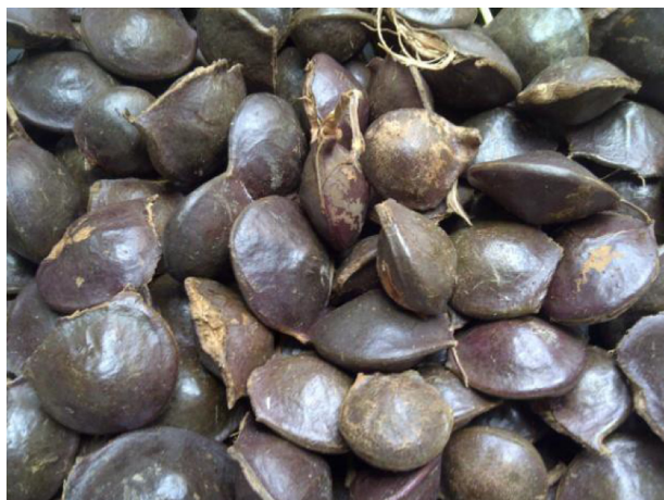
Figure 1 Djenkol bean. Note: Photo courtesy of MR Nirmala.

The patient was healthy with no known medical problems. Medical history noted that the patient had experienced a similar episode as a teenager; he did not seek medical attention at that time and recovered after 14 days. The patient had consumed djenkol beans during the interval period between the two episodes without symptoms. He did not have any recent illnesses and had not taken medications prior to or since the onset of pain.