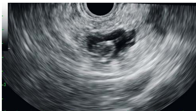
► Fig. 4 EUS image of a MCN with thick septations and mural nodule.