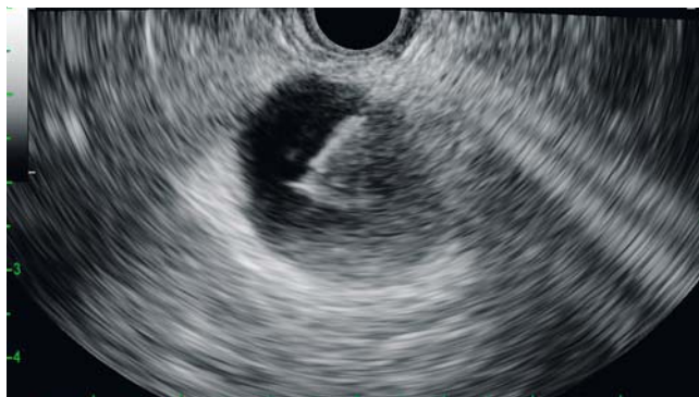
► Fig. 3 EUS image of the microforceps being passed into intracystic space.

A 55-year-old female underwent EUS for evaluation of a pancreatic cystic lesion with a nonenhancing solid component detected by MRI. EUS evaluation revealed a cystic lesion with thick septations and an associated mural nodule (► Fig. 4 ). Histopathology obtained by MFB (Moray Micro Forceps, US Endoscopy, Mentor, Ohio, United States) revealed a cyst lined by bland cuboidal epithelium without dysplasia, however, spindle cells within the cyst wall expressed nuclear estrogen receptors consistent with a MCN. The patient underwent distal pancreatectomy with splenectomy and surgical pathology confirmed a 15-mm MCN with pancreatic intraepithelial neoplasia, however, no evidence for malignancy.