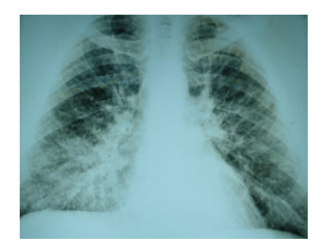
Figure 2. An X-ray of Patient 1 at the time of admission to the intensive care unit (ICU), Mato Grosso, Brazil, 2015

Patient 2 (gold mining region of the União do Norte district, Peixoto de Azevedo in northern Mato Grosso):