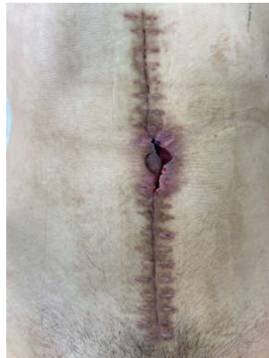
Figure 7. A view of the fistula site after 26 days, at that time colostomy bag was applied.