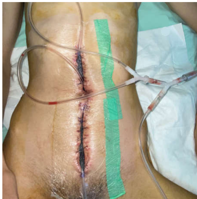
Figure 3. The technique with a suction drain in the fistula (in the middle) and separation of the EAF from the upper and lower part of the wound using two sponges and separate suction.