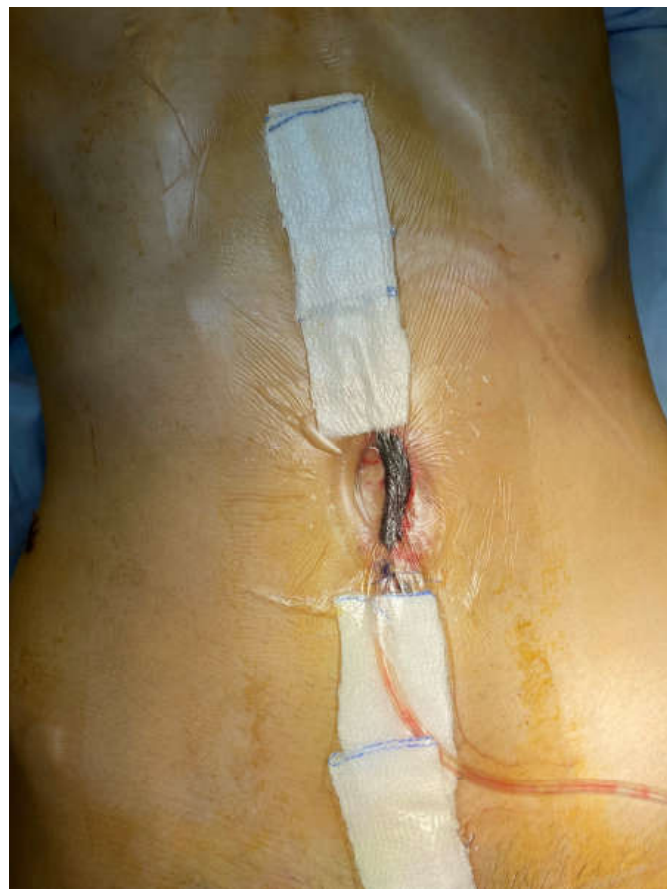
Figure 5. Upper and lower staged closure of the skin, NPWT at the site of the EAF (6 days after the start of treatment).