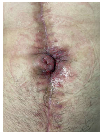
Figure 8. The fistula after 67 days after removal of the colostomy bag.