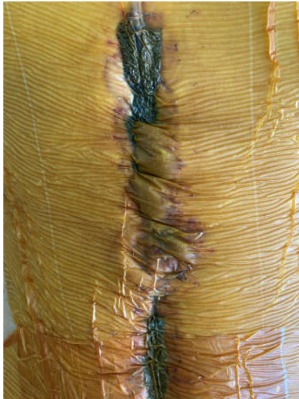
Figure 2. A view of the drain—the lower holes are put over the fistula, while the upper ones are enveloped with a black foam contacting the wound.