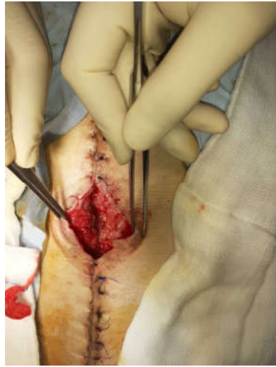
Figure 6. A view of the fistula site 12 days after the start of treatment.