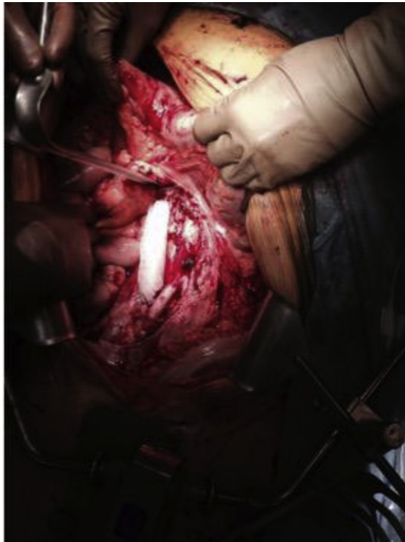
Fig 2. An intraoperative photograph taken after reconstruction of the inferior vena cava (IVC) with tubularized bovine pericardium (BP).

(Fig 2). At this point, the hepaticojejunostomy, pancreaticojejunostomy, and gastrojejunostomy were performed by the surgical oncology team.