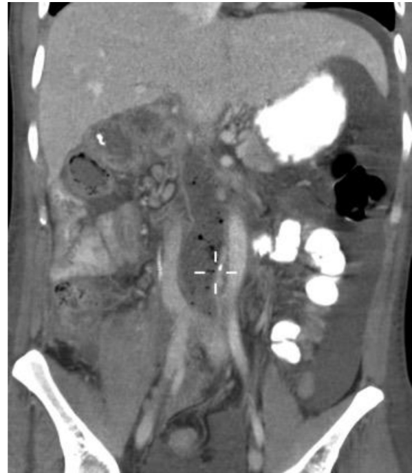
Fig 3. A coronal computed tomography scan of the reconstruction 30 days after the operation. As demonstrated here, the inferior vena cava (IVC) is patent, and the patient is doing well.

Final pathologic evaluation revealed a 19-cm sarcomatoid renal cell carcinoma with extensive pericaval involvement. The patient's postoperative course was complicated by a