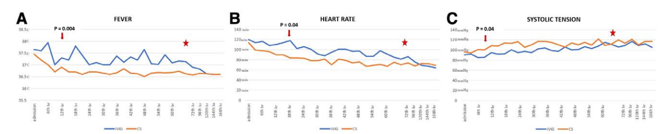
FIGURE 1. The vital parameters dynamics during in-hospital stay. Red star—the moment of corticosteroid administration in IVIG-nonresponders. IVIG indicates intravenous immunoglobulin.

CRP indicates C-reactive protein; Na, sodium; LV EF, left ventricle ejection fraction.