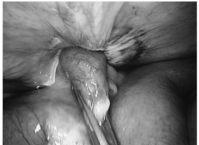
Figure 2. Laparoscopic view of the fully incarcerated Spigelian hernia containing the loop of small bowel.