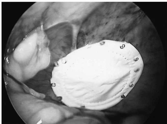
Figure 4. IPOM repair of the Spigelian hernia defect using Bard Ventraliex Hernia Patch secured with Protack.

intact external oblique and vague presenting symptoms. It accounts for 2% of all the emergency surgeries with a high incarceration and strangulation rate. 3 In the largest series of 81 repairs in 79 patients reported from the Mayo Clinic, the incarceration rate was as high as 17%. 3 In yet another large study of 28 patients, 33% of the patients who presented as emergencies had incarceration. 4