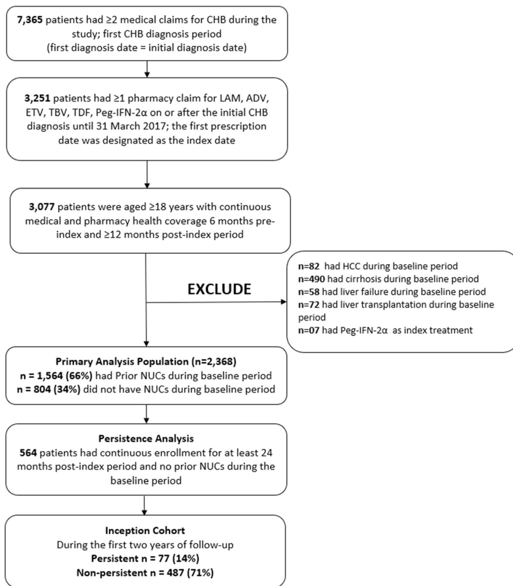
Fig. 1 Patient selection flow diagram. ADV adefovir, CHB chronic hepatitis B, ETV entecavir, HCC hepatocellular carcinoma, LAM lamivudine, NAs nucleos(t)ide

analogues, Peg-IFN-2α pegylated interferon, TBV telbivudine, TDF tenofovir