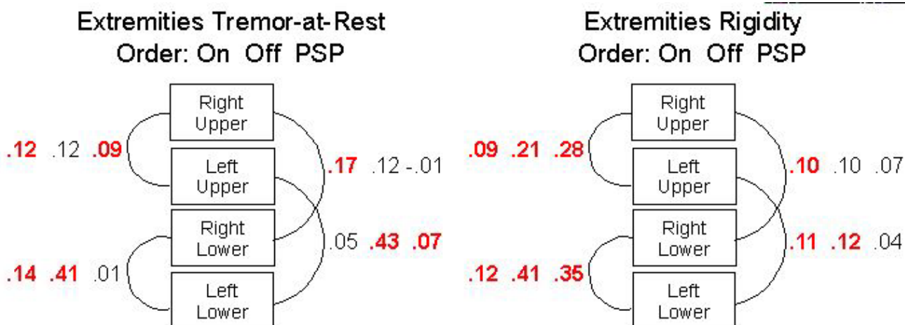
Figure 2 Residual covariances for the Tremor-at-Rest variables and the Rigidity variables. Values are those from the common metric completely standardised solution. The bold values have t-values larger than 3. The order of the three numbers is always: PD-On, PD-Off, PSP.

1999; Cubo et al., 2000) [6-8], who presented the oblimin transformed component solutions for each of the three groups separately.