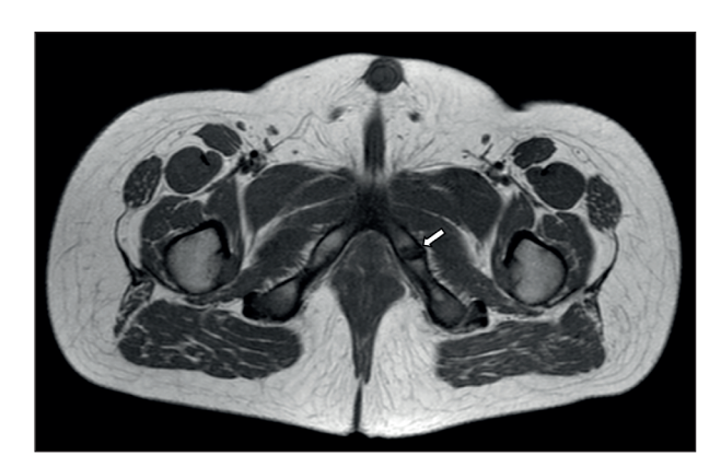
Figure 1. Magnetic resonance imaging transverse plane T1. The lesion is visible as hypointensity signal (white arrow)

However, some cases are thought to be symptomatic and may correlate to X-Ray and MR findings, suggesting stress related pathology.