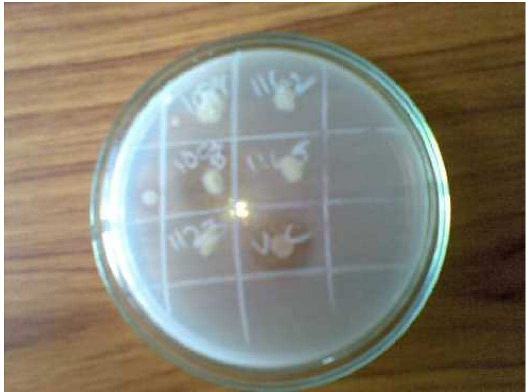
FIGURE 3: Gelatinase Production as Evidenced by Clearance Surrounding the Colonies

Out of 100 E. coli included in the study only 65 strains were isolated from urine and among these isolates 62 isolates were found to be susceptible to nitrofurantoin and three showed resistance. Among test strains majority of E. coli isolates (80%) were sensitive to amikacin whereas only 47% of isolates were susceptible to co-trimoxazole. Susceptibility to ciprofloxacin/norfloxacin (22%) and ceftriaxone (28%) was noted to be low. A higher rate of resistance was observed against cephalothin (84%) and ampicillin (98%). None of the isolates from test strains showed resistance to imipenem. Among control strains included in the study, 46 (92%) isolates showed sensitivity to amikacin, 28 (56%) isolates revealed sensitivity to ciprofloxacin, and all isolates were sensitive to imipenem. The detailed antibiotic susceptibility profile of all the strains tested is shown in Table 4 and demonstrated in Figure 4.