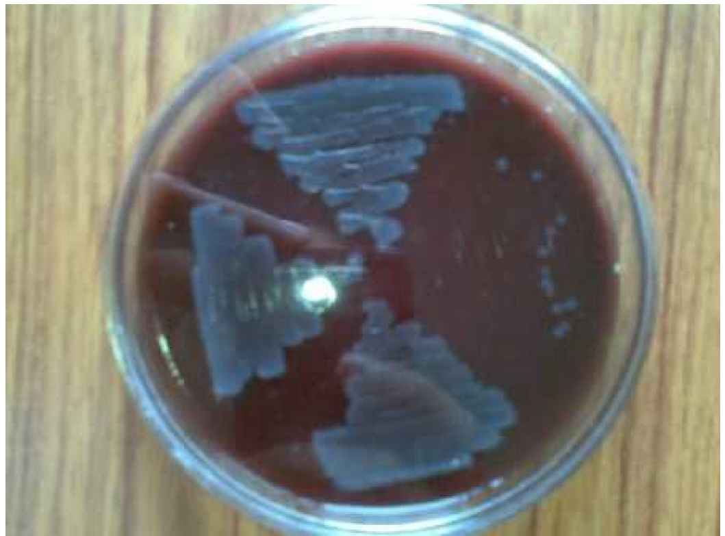
FIGURE 2: Serum Sensitivity and Resistant Pattern of E. coli

The study also showed that 2% of E. coli isolates were gelatinase producers and none among the control group demonstrated this virulence factor as shown in Table 3 and Figure 3.