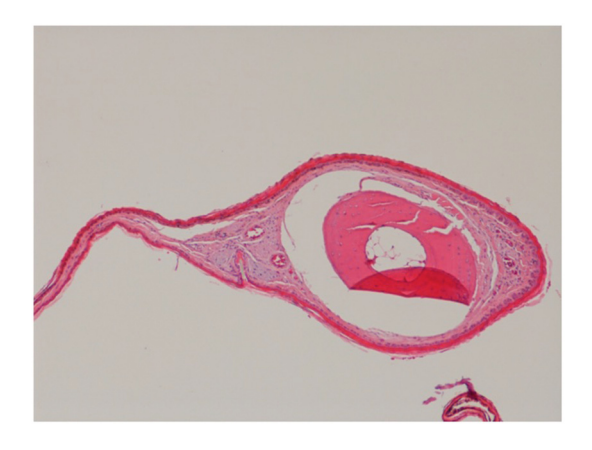
Fig. 1 Bat wing of Corynorhinus townsendii , the Virginia bigeared bat. Corynorhinus belongs to the same family, Vespertillonidae, as Myotis lucifigus and has nearly identical wing structure.

Wing skin of small insectivorous bats consists of a palindromic arrangement of keratinized stratum corneum on