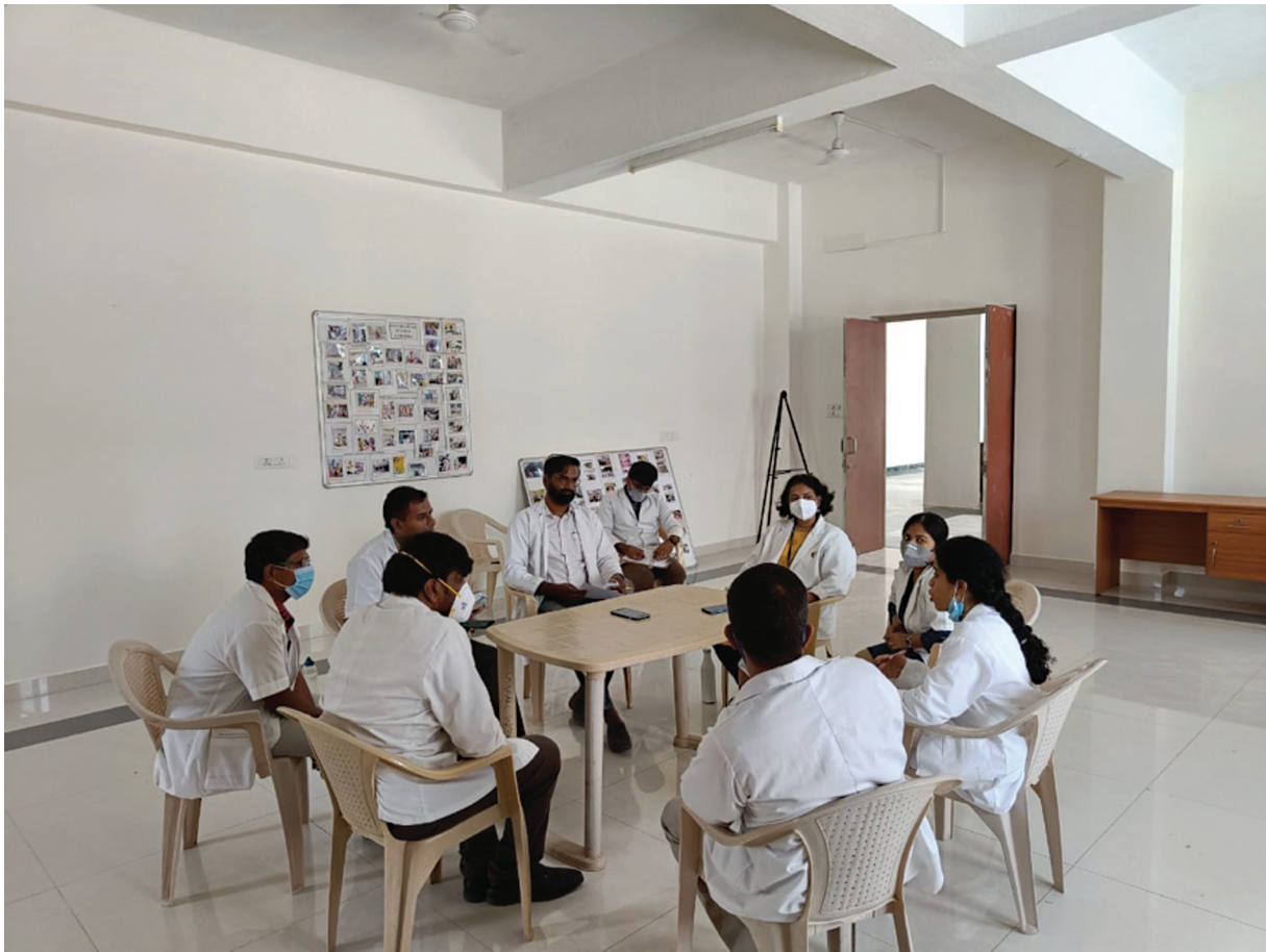
Fig. 1 Focus group discussion.