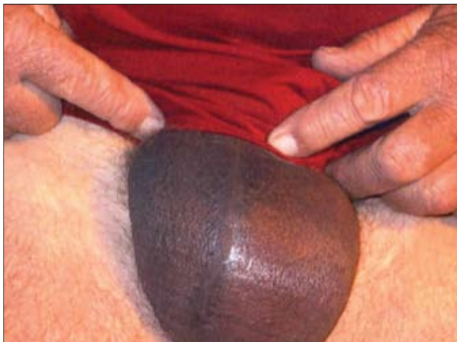
Fig. 1. Scrotal hematoma 3 hours post ESWL.

A 58-year-old man, with a past history of hypercholesterolemia,