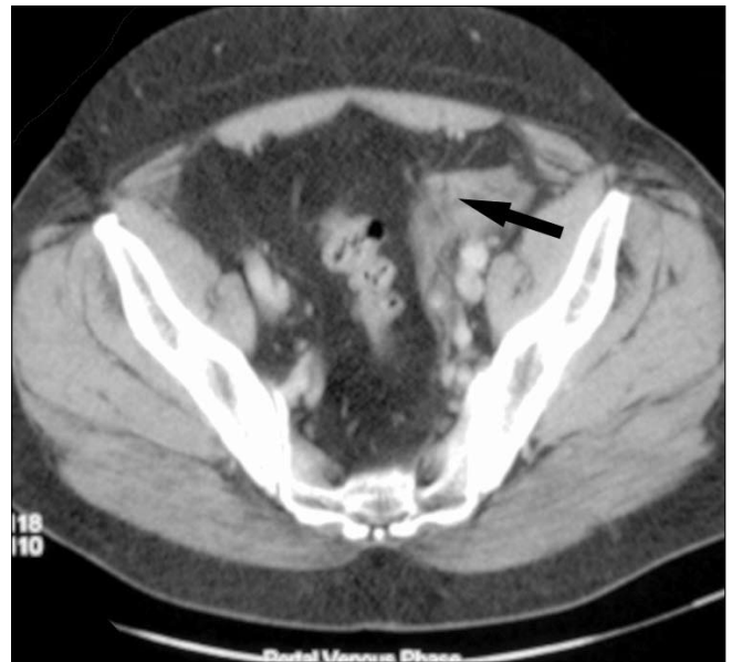
Fig. 2B. Retroperitoneal hematoma tracking inferiorly.

vascularity of the kidney predisposes it to bleed, but in most cases this is a focal process leaving the majority of the renal parenchyma unaffected. However, persistent flank pain post ESWL should be flagged as an early warning sign of perinephric and retroperitoneal bleeding. Furthermore, patients with scrotal ecchymosis alone post ESWL should be considered for further imaging.