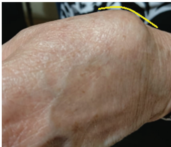
FIGURE 1: A mass located at the snuffbox area of the left hand.

one year prior to her presentation. She describes her mass as small at the beginning and gradually increasing in size. Upon physical examination, we noticed an irregular dark grey focally congested membranous fragment associated with a separate rubbery to firm beige tissue fragment (Figure 1). The mass was pulsatile, but no bruit was heard upon auscultation. The finding on Allen's test was positive. Upon further full body inspection and auscultation, no evidence of other aneurysms in other parts of the body was found. A laboratory workup was preformed, and results were negative for any evidence of systemic inflammation or disease of autoimmune etiology.