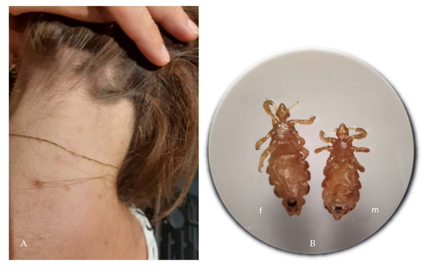
Figure 1. Scalp infestation caused by Pediculus humanus capitis accompanied by allergic reaction ( A ); Pediculus humanus specimens removed from the patient's scalp ( B ); f—female; m—male; original magnification 10×, photo by Katarzyna Bartosik.

Lice infestation leads to development of a hypersensitivity reaction to the components of the saliva of these insects appearing after 4–6 weeks in the case of the first infestation or after ca. 2 days in re-infestation [11]. In the area of the hairy skin of the head, and less often on the neck (Figure 1), papular itchy lesions can be observed at the parasite feeding site, which may result in excoriations. Secondary infection with Staphylococcus aureus and streptococci (impetiginization) may develop as well. Local enlargement of cervical lymph nodes has been observed in some patients. Severe and chronic infestation may lead to anemia and alopecia [13]. Furthermore, the awareness of lice infection may cause stress and emotional tension, leading to irritability and sleeplessness [14,15].