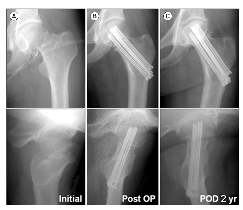
Fig. 1. A 51-year-old woman visited the Emergency Medical Center of Inha University Hospital for left hip pain after car accident. (A) Initial hip joint anteroposterior (AP) and axial views show subcapital femoral neck fracture. (B) Immediate postoperative hip joint AP and axial views. (C) At postoperative 2 years, avascular necrosis of femoral head was diagnosed.