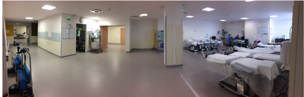
Figure A1. Picture of a surgical transfer and waiting area. Patients arrive from the floor (left), received by a paramedical staff and transferred to the surgical tables (right, far corner), and are then dispatched to the ORs (exit, center). The PACU entrance/exist is just behind the central spot.