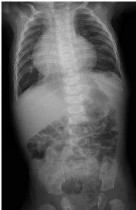
FIGURE 3 Chest and abdominal X-ray findings at one year old. Chest X-ray indicated no recurrence of chylothorax or left CHD at one year old

treatment, complete resolution of pleural fluids can be observed within 30 days for 80% of congenital chylothorax patients. 5