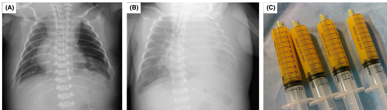
FIGURE 1 Chest X-ray after surgery for CDH and the appearance of pleural effusion. (A) Pleural effusion was not noted just after the operation. (B) The pleural effusion increased after initiating breast milk feeding. (C) Chylothorax was confirmed by the appearance of pleural effusion underwent thoracentesis at 15 days

Chylothorax is a rare but life-threatening condition in neonates, particularly in neonates with chromosomal abnormalities. It is well known that chylothorax is often seen in children with chromosomal abnormalities, such as trisomy 21, Turner's syndrome, and Noonan's syndrome due to vascular and lymphatic malformations. 2 Conservative treatment using MCT-based formula, octreotide, somatostatin analogs, or corticosteroids has traditionally been performed due to their effect on splanchnic circulation and lipid absorption. 4 With conservative