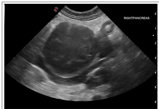
Figure 1 Ultrasound image of one of the pancreatic cystic structures at the time of diagnosis. Large, spherical structure filled with anechoic fluid within the hypoechoic pancreas

Animal Health) had been started. At the time of referral, the patient was receiving 6 IU in the morning and 1 IU in the evening. The owner reported that the patient's appetite had improved slightly since starting treatment; however, PU/PD persisted and the patient continued to lose weight.