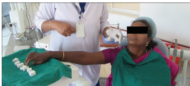
Figure 4: The subject is identifying the correct shape