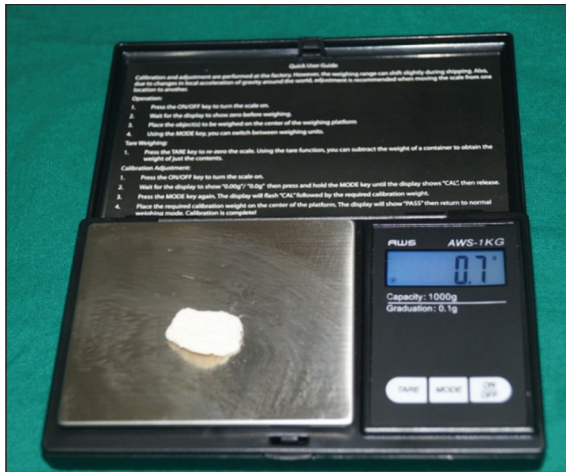
Figure 6: Chewed gum weighed after desiccation