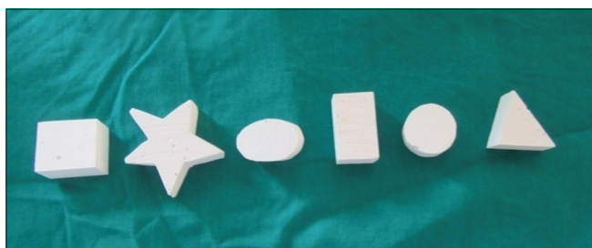
Figure 2: Over-sized plaster models for identification

Unstimulated salivary flow rate was estimated by measuring the time taken to collect 5 ml of the whole saliva. Saliva is said to be "unstimulated" when no exogenous stimulation by mechanical or pharmacological agents is present. The saliva was collected using the spitting method, as this is considered the most reproducible method. [8] After rinsing the mouth with water, saliva was allowed to accumulate in the floor of the mouth and repeatedly expectorated into a graduated measuring jar to collect 5 mL [Figure 7]. The