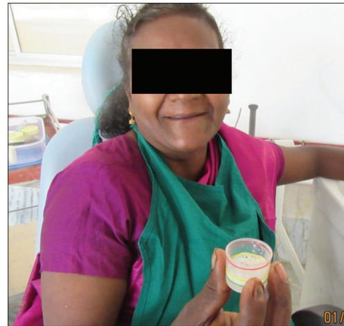
Figure 7: The subject with a collected saliva sample

collection time was recorded using a stopwatch. The test was repeated in the same manner after 6 months.