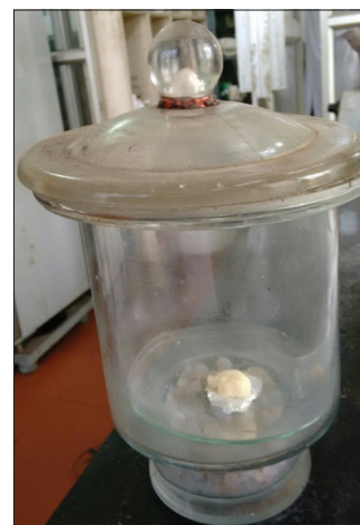
Figure 5: Chewed gums kept in a desiccator for 24 h for drying