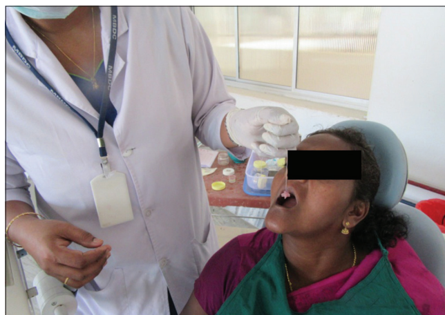
Figure 3: Introduction of test forms to the subject