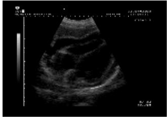
FIGURE 3. Ultrasound on day 3 for the patient, showing reduction in pericardial effusion.

tion. 11 All diagnostic studies have the common problem of the lack of a definitive gold standard. Whether novel diagnostic technologies that use the polymerase chain reaction have sufficient accuracy with samples such as pericardial fluid requires well-designed studies.