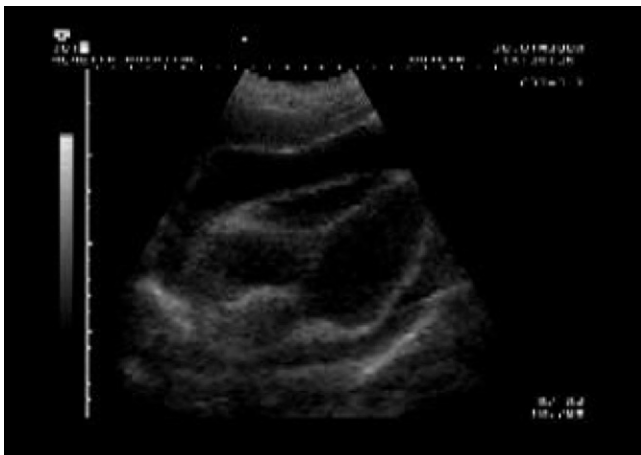
FIGURE 2. Ultrasound post-pericardiocentesis for the patient, showing persistent large effusion but improved right ventricular filling.

In countries with a high prevalence of TB, this disease has been reported as the cause of more than 90% of large pericardial effusions in HIV-infected persons. 8 Other potential causes include bacterial pericarditis (e.g., non-typhoidal Salmonella ), human herpesvirus-8-related disease, and lymphoma. Definitive diagnosis of tuberculous etiology is challenging because studies have shown the yield from direct smear examination of pericardial fluid to be as low as 2% 9 ; culture of pericardial fluid is positive in 38–56% of cases. 9,10 Other indirect methods used to support TB diagnosis, such as adenosine deaminase levels in pericardial fluid, have the limitation of lower sensitivity in persons with advanced HIV infec-