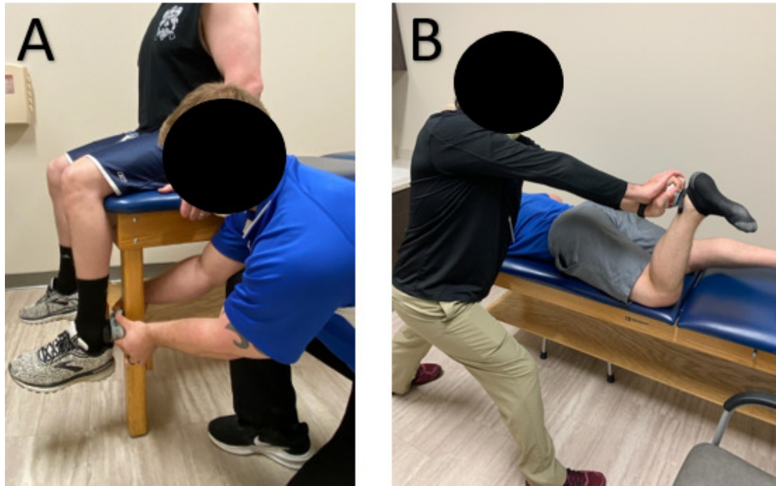
Figure 2. Testing methods.

A) The participant is seated at the edge of a table with the hip and knee flexed to 90 degrees and hands gripping the sides of the table while the clinician stabilizes the dynamometer between the participant’s leg and table. B) The participant is prone with the hip at 0 degrees and knee at 90 degrees and hands gripping the sides of the table while the clinician assumes a stride stance with elbows locked in extension to stabilize the dynamometer on the participant’s leg.