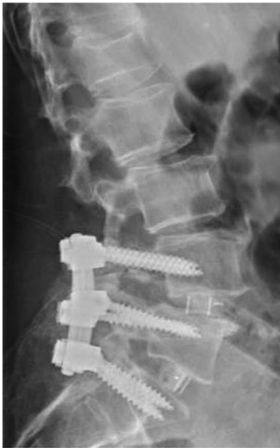
Figure 4: Standing neutral lateral lumbar radiograph obtained the day following the patient's L4-S1 revision decompression and posterior instrumented fusion with TLIF performed at each of these revised levels. A moderate correction of the prior L4-5 anterolisthesis was achieved and the patient's spine and construct appear stable.

multiple low-energy falls. As a result of the patient's combined injury morphology and subsequent progression of listhesis, it was felt that revision decompression with an interbody fusion was reasonable. He has benefitted from surgery and his symptoms resolved.