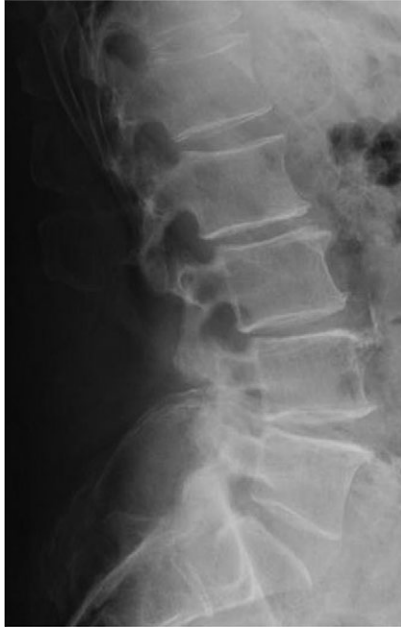
Figure 1: Standing lateral lumbar radiograph obtained 2 weeks following the patient's initial lumbar surgery (L3–S1 laminectomy). No instability is noted on the postoperative image.

decompressive surgery was performed (Fig. 1). After laminectomy, the patient's gait tolerance improved. Following a subsequent series of low-energy falls, his outpatient work-up revealed fractures through the bilateral L4 pedicles and the posterior third of the L5 vertebral body, with a recurrence of axial back pain and bilateral