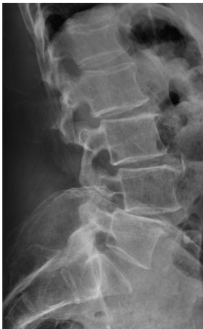
Figure 2: Standing neutral lateral lumbar radiograph obtained 17 months following the patient's L3–S1 laminectomy. The patient is now dealing with a Grade 1 anterolisthesis of L4 on L5, with a mild degree of retrolisthesis at each of the cranial levels depicted.

lower extremity radiculopathy (Figs 2 and 3a–c). The patient underwent a revision decompression from L4–S1 and posterior instrumented fusion with a TLIF performed at each of these revised levels. His axial back pain and radiculopathy improved postoperatively (Fig. 4).