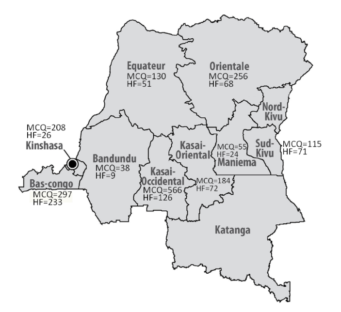
Figure 2. Location of 1849 eligible MCQ answers (MCQ) and of 680 health facilities (HF) participating in the EQA. doi:10.1371/journal.pone.0071442.g002