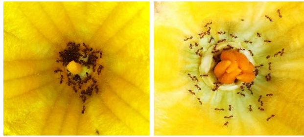
Figure 1. A staminate (male) and a pistillate (female) flower of pumpkin ( Cucurbita maxima ) occupied by the ants.

of ants occupied a single flower. Whenever the ant colony was too large in number, the flowers were cut open to facilitate counting the ant individuals.