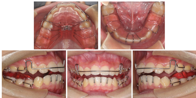
Figure 2 The removable Twin-block appliance combined with rapid maxillary expansion used in the orthodontic treatment.