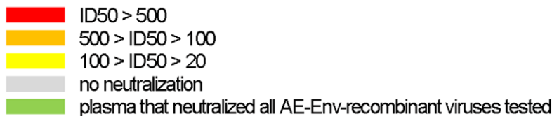
Figure 2. Anti-HIV-1 neutralizing activity of plasma derived from 34 slow progressors against AE-Env-recombinant viruses.

Neutralizing activity of plasma samples against 8 AE-Env-recombinant viruses was evaluated as described in the legend to Figure 1. Data are presented as the means of at least three independent experiments. Plasma IDs and AE-Env-recombinant viruses tested are denoted on the left side and above the panel, respectively. In addition, mean ID50 values and the percentages of virus/plasma combinations (% neutralization) in which viral neutralization was observed among the data sets in horizontal and vertical directions are shown on the right side and bottom of the panel, respectively. ID50 values >500, values 100–500 and values 20–100 are highlighted in red, orange and yellow, respectively. No neutralization (ID50 values <20) of a recombinant virus is denoted by a gray background. Plasma samples that neutralized all recombinant viruses tested are highlighted in green.