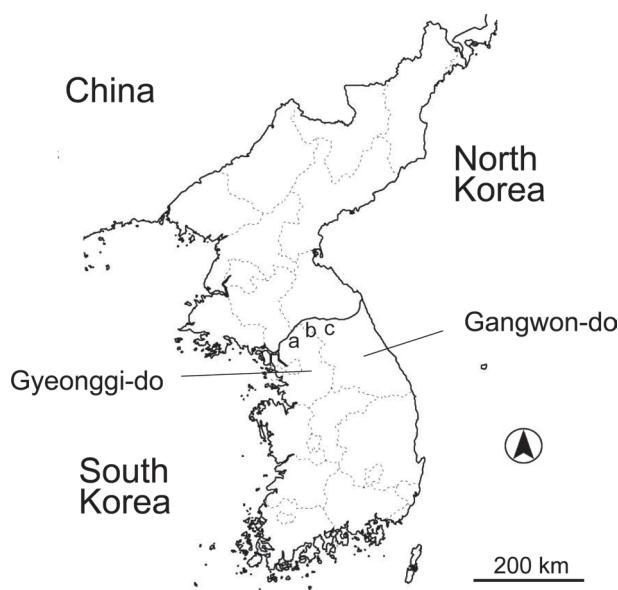
Fig. 1. Collection sites of feathers in the northern part of South Korea. (a) indicates Wangjing-myeon, Yeoncheon-gun in Gyeonggi-do. (b) and (c) indicate Cheorwon-eup and Dongsong-eup, Cheorwon-gun in Gangwon-do.

We found by chance four flight feathers in the nest of a red-crowned crane south of Hitomi-numa Pond in Sarobetsu Wetland (Fig. 2). At that time, we did not see any cranes or hear any calls from cranes. It is likely that these four feathers were from a nesting pair of cranes. Cranes including chicks and nests had been found several times from 2003 to 2015 in this area [10]. Female- and male-derived feathers were included in the feathers we found. The haplotype of the two female feathers was Gj2, the most major haplotype in the island population of red-crowned cranes (Table 1) [1, 12]. Surprisingly, however, the haplotype of both of